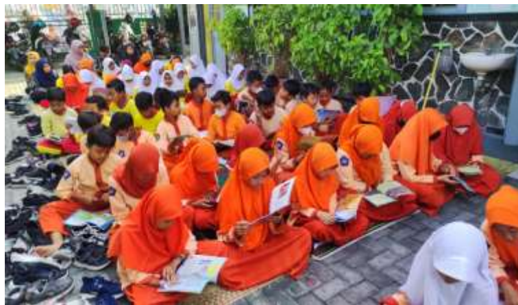
Figure: 2. Literation of Listen