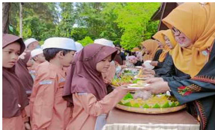
Figure 3. One day Culture