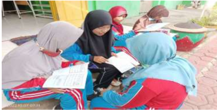
Figure: 1. Literation of reading