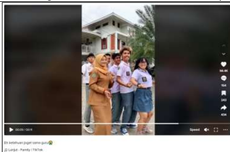
Table 3. Meaning of the denotation and connotation of @kurapskuyy_

Society certainly holds the view that a teacher should be able to be a good role model for their students. Therefore, teachers are expected to position themselves as exemplars in order to build character for their students (Prasetyo et al., 2019). This is done in various forms, ranging from discipline, behavior, and various actions that represent the image of a teacher. However, nowadays, these efforts must also aim to bridge the gap between students and teachers. As seen in Table 3, a teacher in their uniform engages in Tiktok dances with their students.