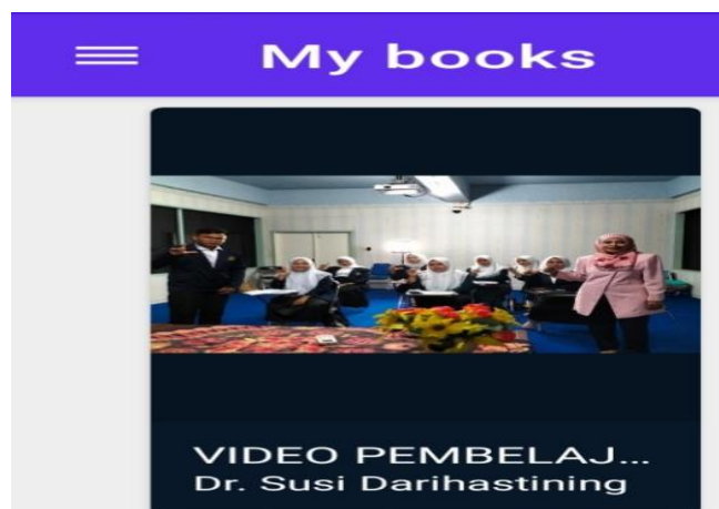
Figure 2.2 Teaching Video of Microteaching Report (Students' creativity using E-PUB application) https://youtu.be/F0uxeE1RjQE

Darihastining, S. (2022). Teaching Materials Through Local Wisdom in Implementing Independent Curriculum to Improve Teaching Skill for Indonesian Pre-Service Teacher . Indonesian Journal of Instructional Media and Model , 4(2), 61-67. doi: https://doi.org/10.32585/ijimm.v4i2.2914