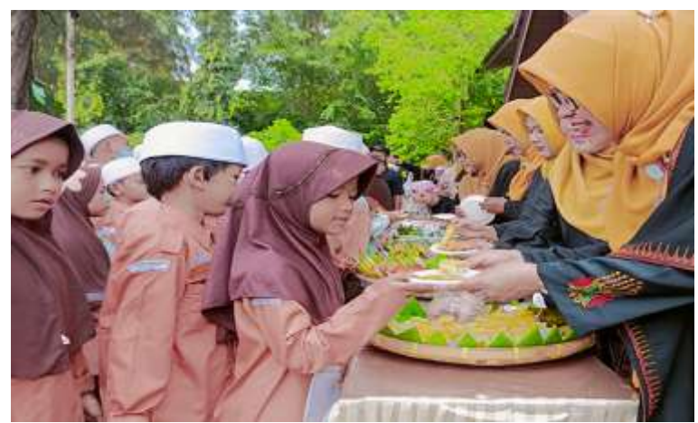
Figure 3. One day Culture