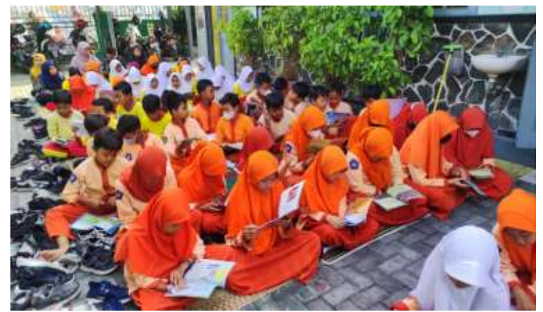
Figure: 2. Literation of Listen