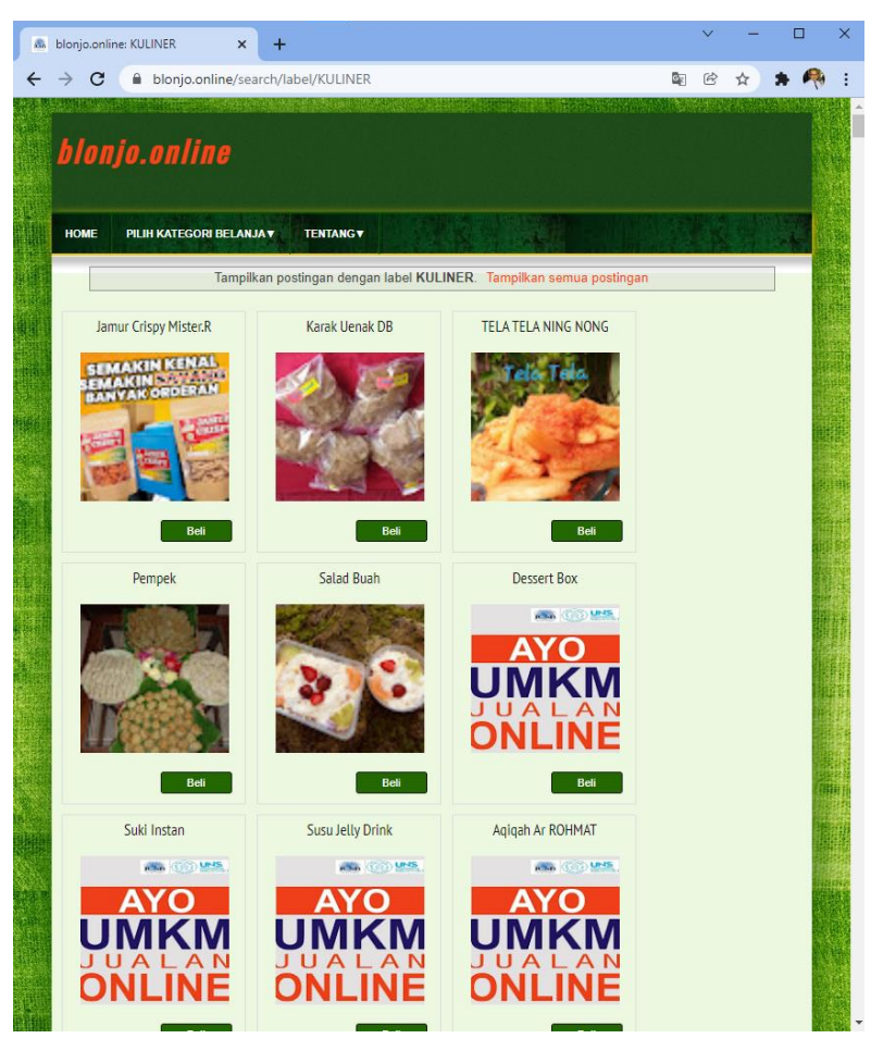
Figure 3. Information System Display Web-based for Marketing MSME Products and Services in Baki. District

Good document management is not only essential but can save time. Write down the document's structure in a clear framework that does not deviate from the stated goals and objectives of the reader. Things to note a. Opener for introducing the paper to the reader accompanied by a brief review of the document's purpose, b. Closing that uses this section to make a summary or ask for suggestions and opinions from readers, and c. The main menu introduces the contents of the entire website content.